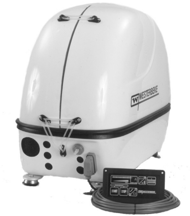
3.8BCDT Marine Diesel Generator