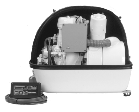
3.8BCDT Marine Diesel Generator

The standard plug-in remote control panel is designed to be user friendly and provides the operator with all the necessary information and controls to use the generator. The panel includes one-touch start/stop controls, automatic shutoffs with indicating lights for low oil pressure and high engine temperature, a battery charge indicator light and an AC load indicator.